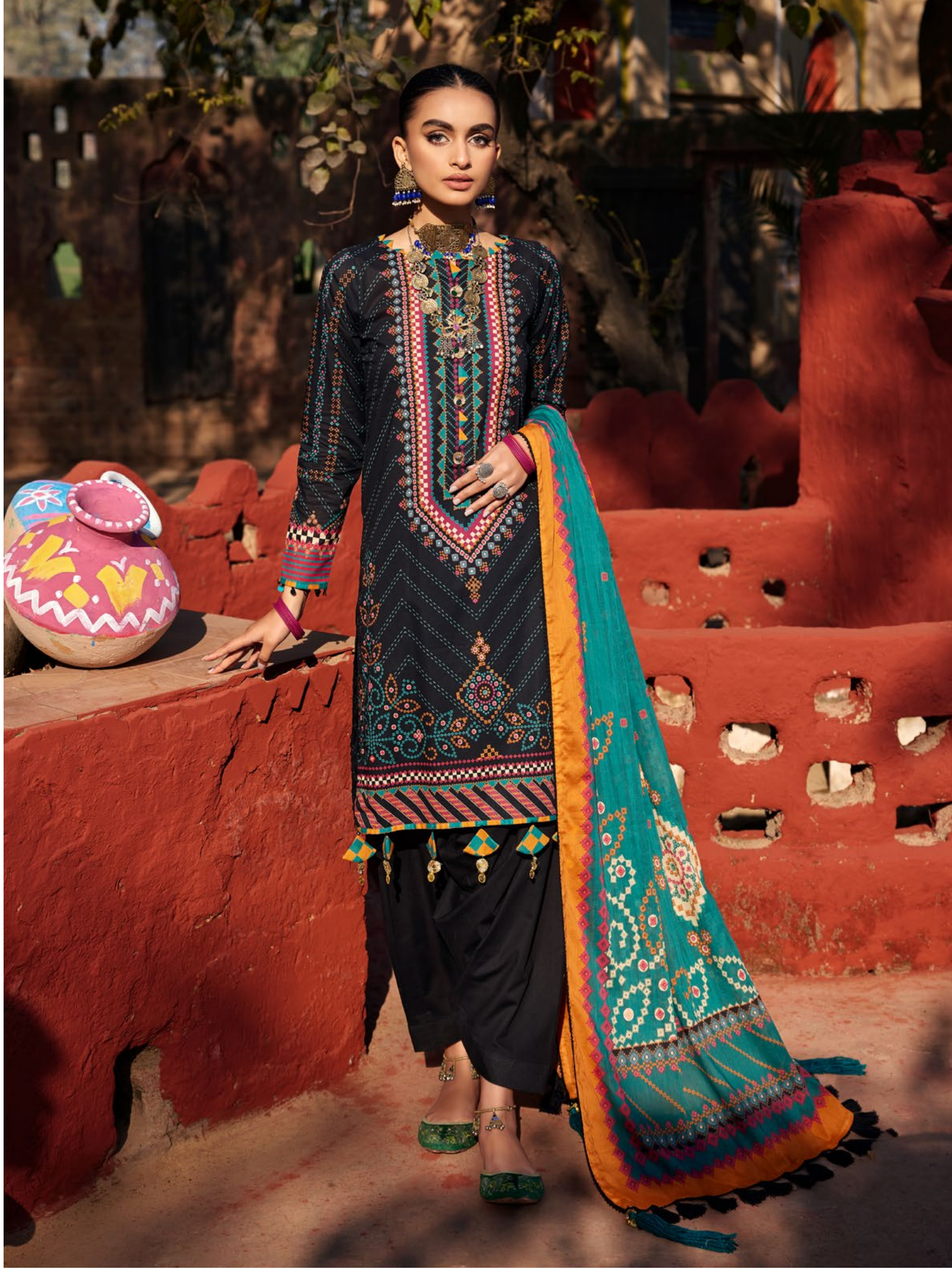
EZS-L3-04-12 | 3 PC Digital Printed Lawn Shirt with Digital Printed Swiss Lawn Dupatta. Dyed Cambric Trouser.