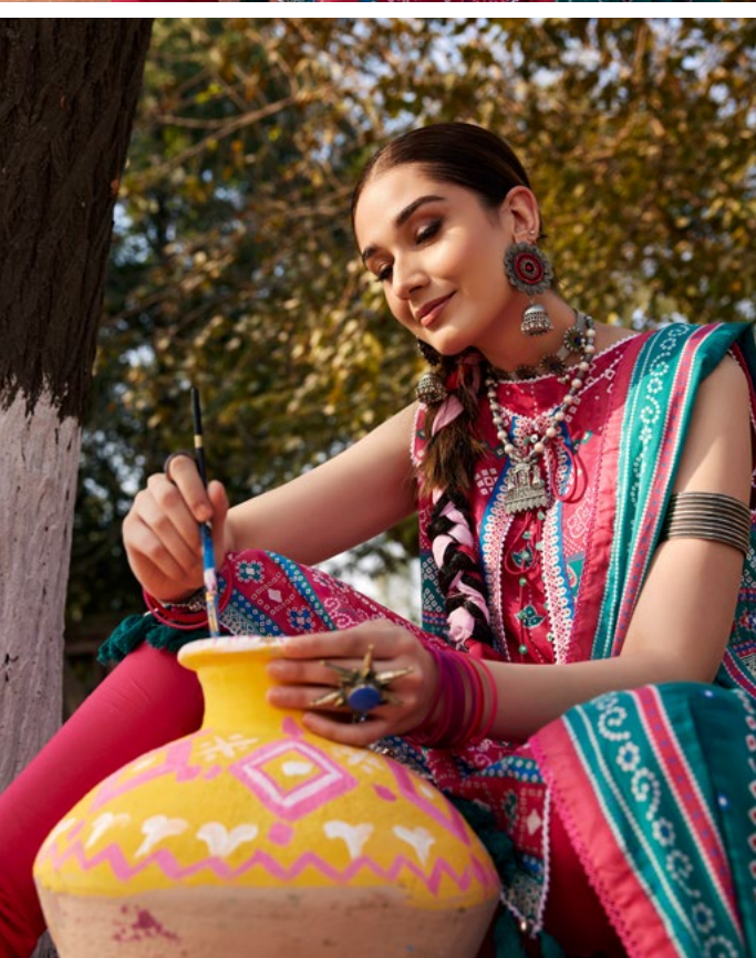
EZS-L3-04-05 | 3 PC Digital Printed Lawn Shirt with Digital Printed Swiss Lawn Dupatta. Dyed Cambric Trouser.