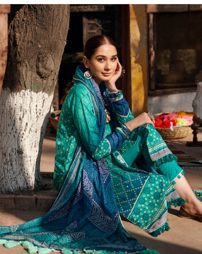
EZS-L3-04-03 | 3 PC Digital Printed Lawn Shirt with Digital Printed Swiss Lawn Dupatta. Dyed Cambric Trouser.