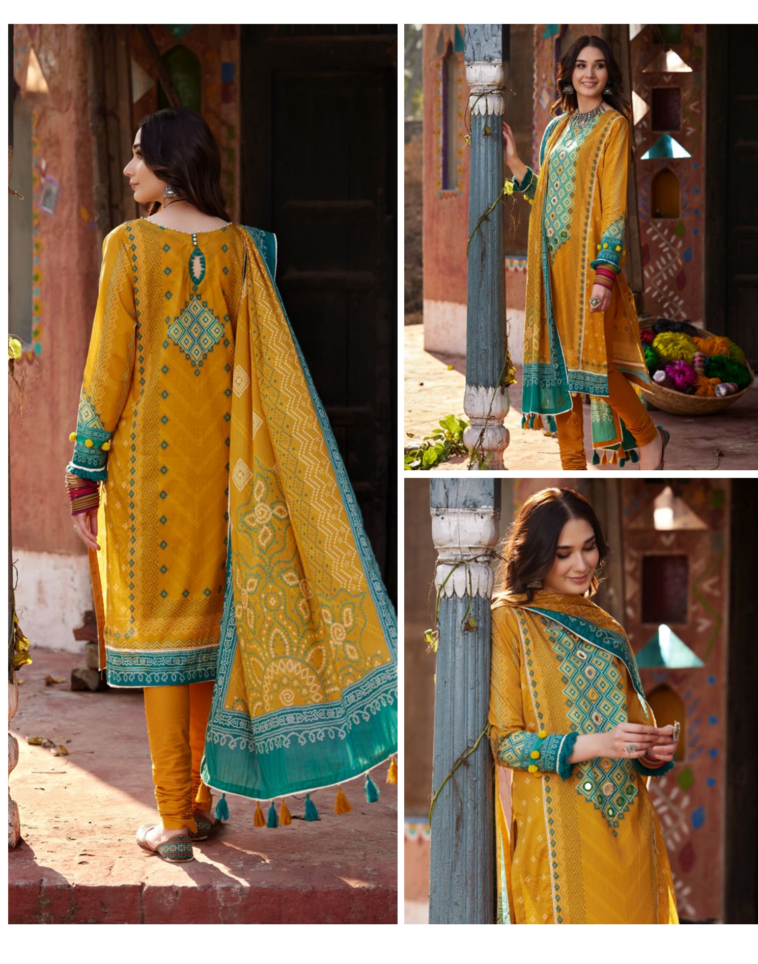
EZS-L3-04-10 | 3 PC Digital Printed Lawn Shirt with Digital Printed Swiss Lawn Dupatta. Dyed Cambric Trouser.