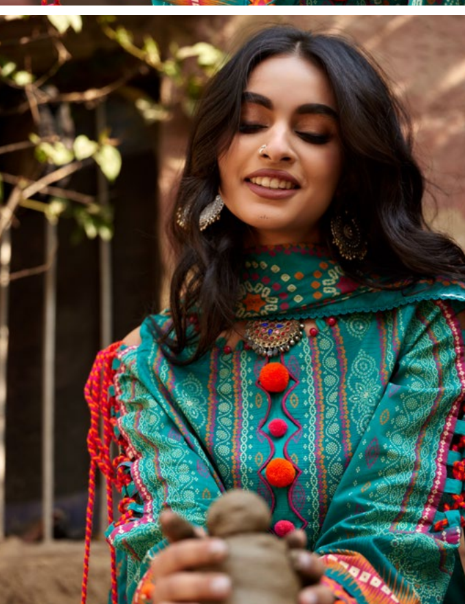
EZS-L3-04-09 | 3 PC Digital Printed Lawn Shirt with Digital Printed Swiss Lawn Dupatta. Dyed Cambric Trouser.