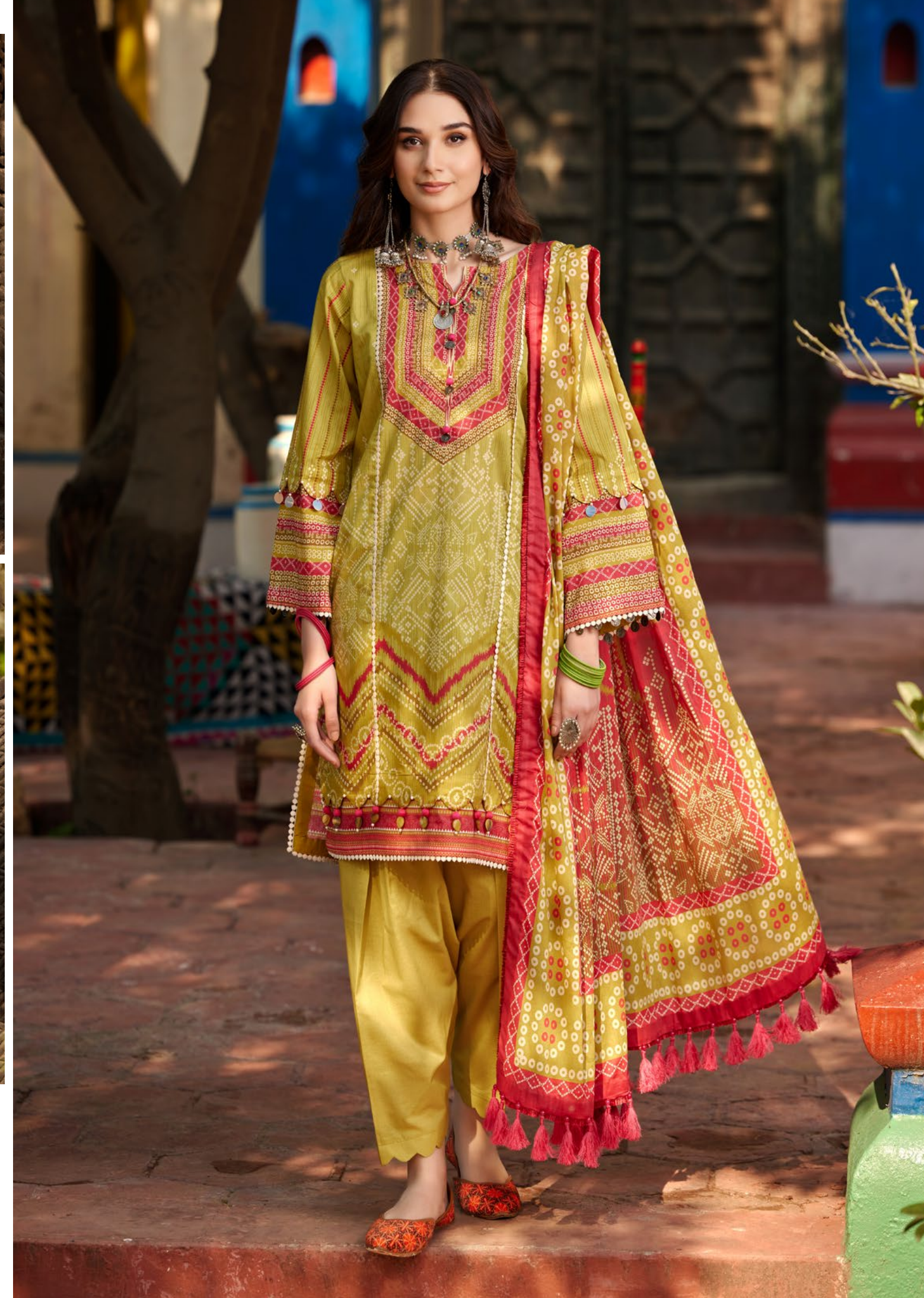
EZS-L3-04-04 | 3 PC Digital Printed Lawn Shirt with Digital Printed Swiss Lawn Dupatta. Dyed Cambric Trouser.