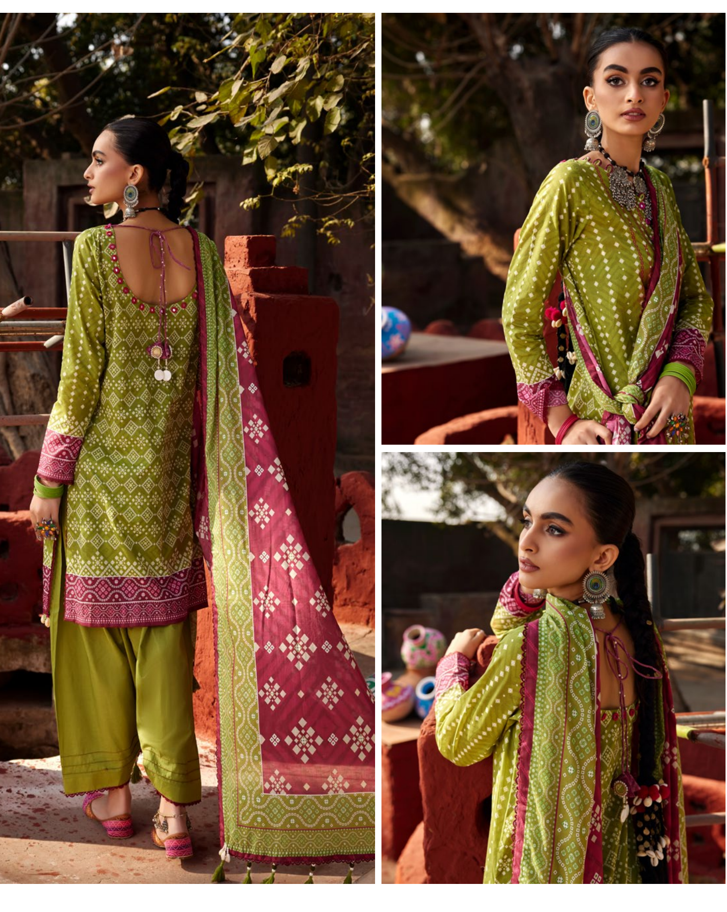
EZS-L3-04-06 | 3 PC Digital Printed Lawn Shirt with Digital Printed Swiss Lawn Dupatta. Dyed Cambric Trouser.