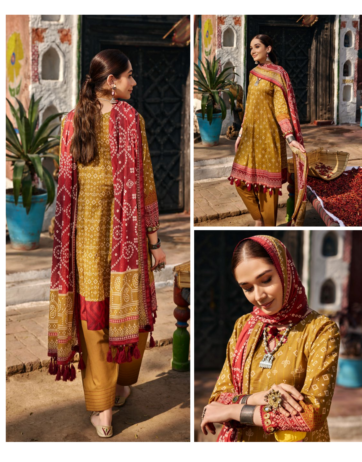
EZS-L3-04-02 | 3 PC Digital Printed Lawn Shirt with Digital Printed Swiss Lawn Dupatta. Dyed Cambric Trouser.