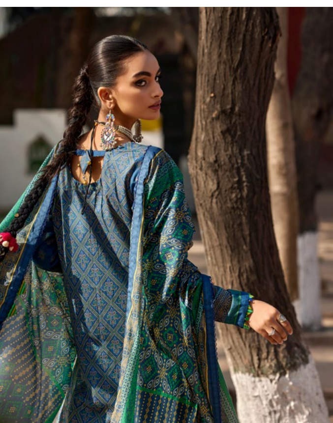
EZS-L3-04-07 | 3 PC Digital Printed Lawn Shirt with Digital Printed Swiss Lawn Dupatta. Dyed Cambric Trouser.