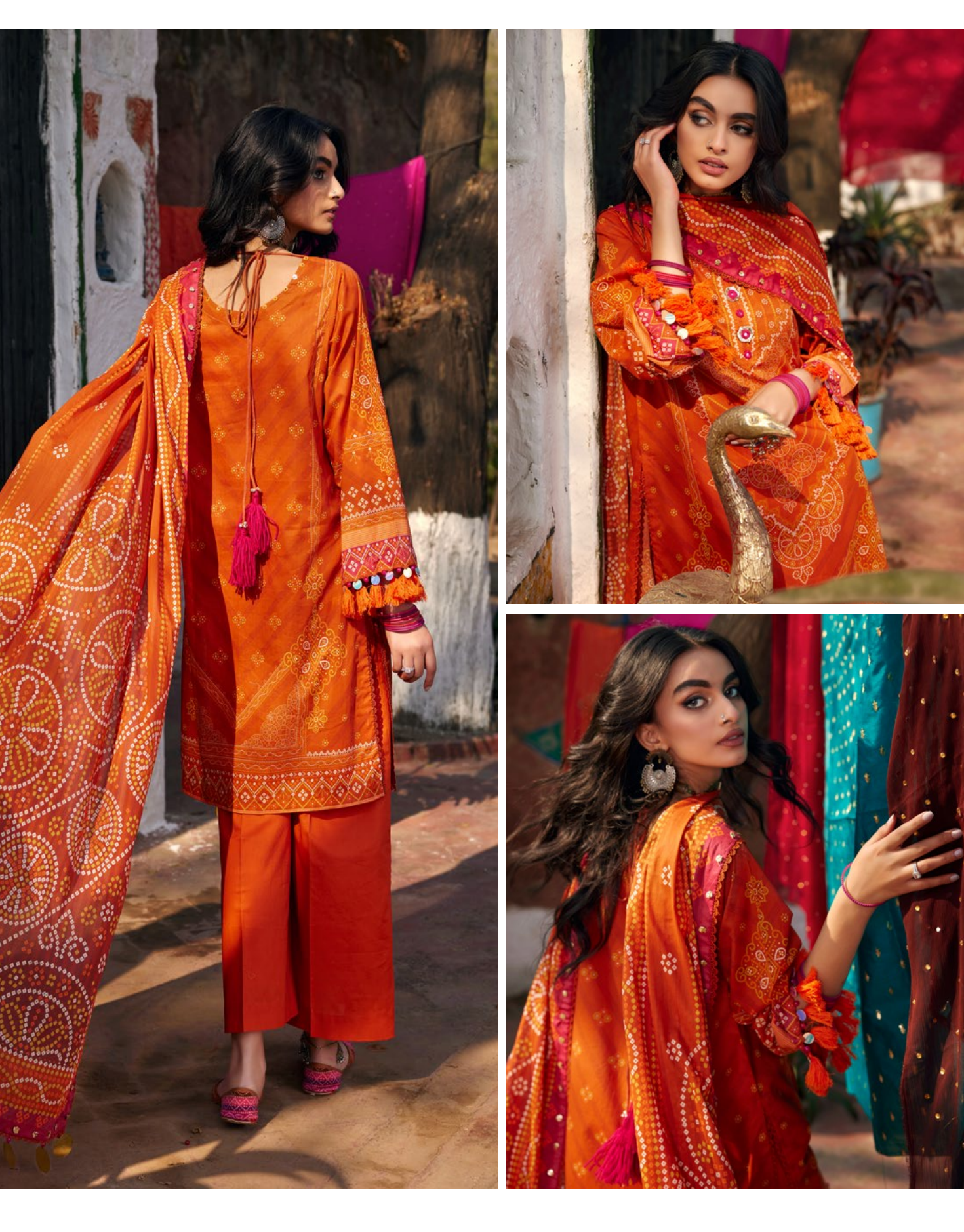
EZS-L3-04-08 | 3 PC Digital Printed Lawn Shirt with Digital Printed Swiss Lawn Dupatta. Dyed Cambric Trouser.