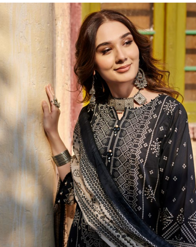
EZS-L3-04-01 I 3 PC Digital Printed Lawn Shirt with Digital Printed Swiss Lawn Dupatta. Dyed Cambric Trouser.