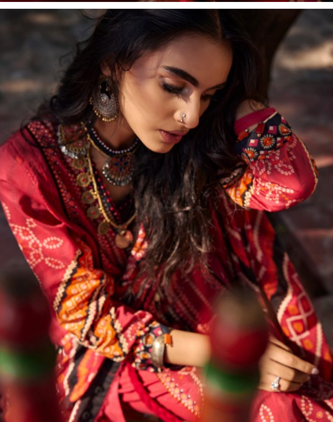
EZS-L3-04-11 I 3 PC Digital Printed Lawn Shirt with Digital Printed Swiss Lawn Dupatta. Dyed Cambric Trouser.