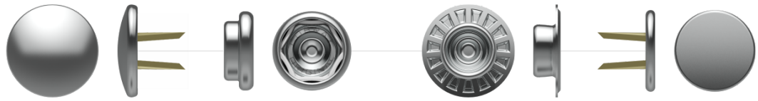
U CAP from Ø9,5 to Ø26 mm