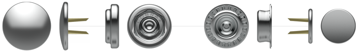
U CAP from Ø9,5 to Ø26 mm