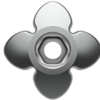
SOCKET 19x19 mm