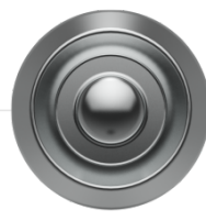
STUD Ø17,5 mm