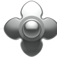
STUD 19x19 mm