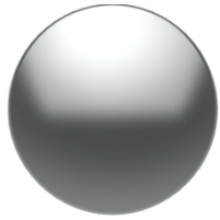
F CAP from Ø9,5 to Ø17 mm