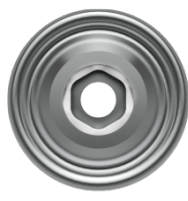
SOCKET Ø17,5 mm