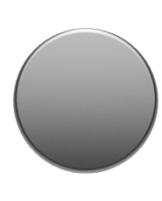
BC BACK-PART Ø14 mm