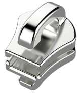
KOBO DOUBLE BRIDGE