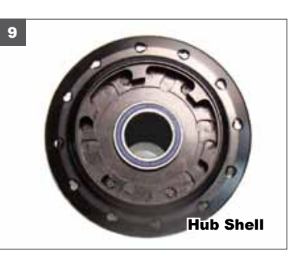
9. Clean out the hub shell for inspection and new grease.