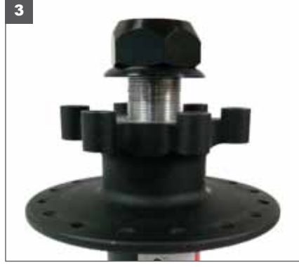
3. Keep the 5mm hex wrench in drive side (side with cassette) end cap to hold the axle in place and unthread the hex or knurled nut with dust seal.