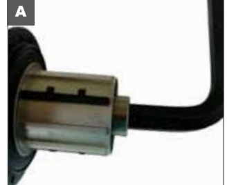
A. Insert 10mm hex wrench into drive side end cap. Keep the 10mm hex wrench in place.