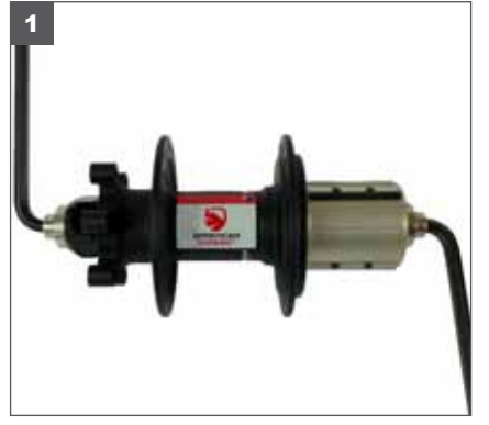
1.Insert a 5mm hex wrench into each end of the silver endcaps (where quick release goes though, one on each side).