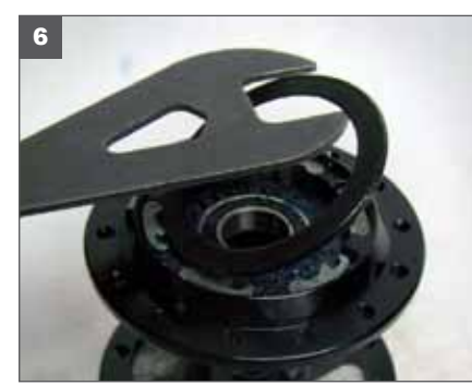
6. Remove large black pawl seal from the hub shell.

Note: Some hubs have an additional 0.5mm spacer between the cassette body and the outer axle cap.