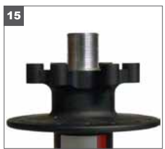
15. When the bare threaded axle is showing, grease threads and then re-install the knurled adjusting nut and end cap.