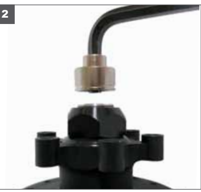
2. Unthread non-drive side end cap only (side with no cassette).