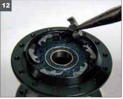
12. With a thin layer of clean grease coating the top of the cam plate, install all 6 pawls. Once completed, the pawls should freely engage in unison with the cam plate.

Proper re-assembly is important to rider safety. All repairs should be performed by a professional bicycle mechanic. sales@amclassic.com • www.amclassic.com