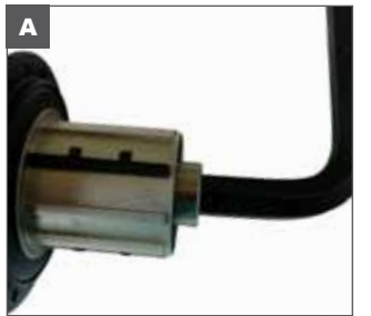
A. Insert 10mm hex wrench into drive side end cap. Keep the 10mm hex wrench in place.