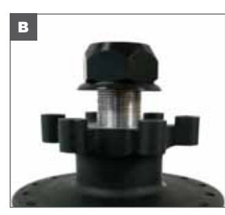
B. Tighten the adjusting nut with dust seal until snug against the bearing. The O-ring inside the adjusting nut provides drag to hold the bearing adjustment.