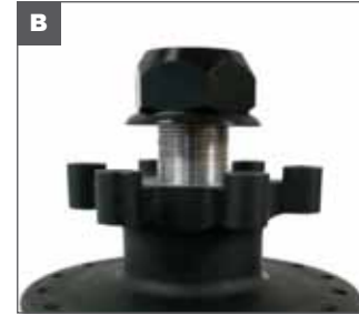
B. Tighten the adjusting nut with dust seal until snug against the bearing. The O-ring inside the adjusting nut provides drag to hold the bearing adjustment.