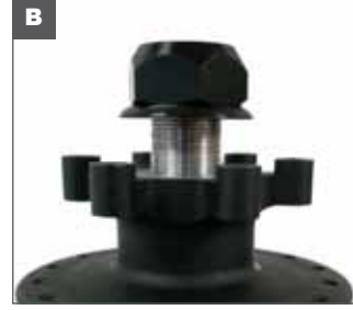
B. Tighten the adjusting nut with dust seal until snug against the bearing. The O-ring inside the adjusting nut provides drag to hold the bearing adjustment.