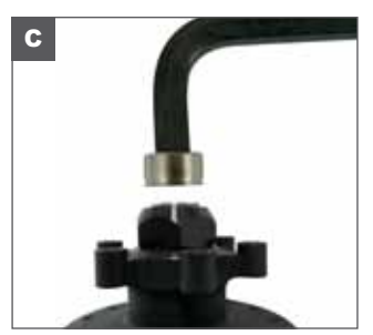
C. Keep 10mm hex wrench in drive side. Thread on the end cap with another 10mm hex wrench.