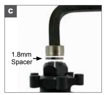
C. Keep 10mm hex wrench in drive side. Place the 1.8mm spacer on the axle and thread on the end cap using another 10mm hex wrench.