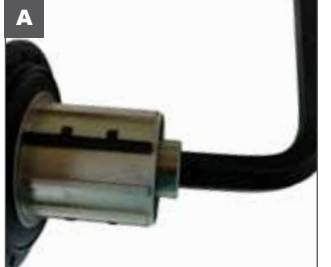
A. Insert 10mm hex wrench into drive side end cap. Keep the 10mm hex wrench in place.