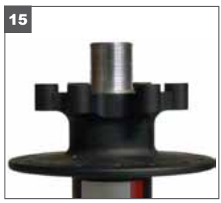
15. When the bare threaded axle is showing, grease threads and then re-install the knurled adjusting nut and end cap.