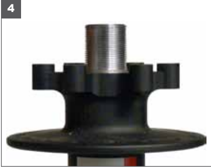
4. Once the end cap and adjusting nut are removed, you are ready to open the hub.