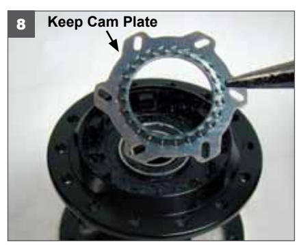
8. Remove cam plate. IMPORTANT: Keep cam plate for re-installation in Step 11.