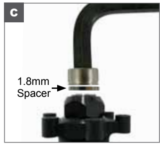
C. Keep 10mm hex wrench in drive side. Place the 1.8mm spacer on the axle and thread on the end cap using another 10mm hex wrench.