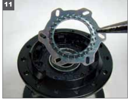
11. With a thin layer of clean grease coating the hub shell, re-install the cam plate. Refer to the picture for the correct orientation. Do not put the cam plate in upside down.

Note: Using bearings other than American Classic bearings will void the warranty and they may not function properly.