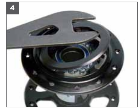
4. Remove large black pawl seal.

3. Separate cassette body and axle from the hub shell by grabbing the body and pulling out from the drive side.