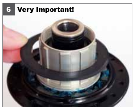
6. The large black Pawl Seal MUST be installed after the cassette body and axle have been joined with the hub shell. With the axle pushed completely into the hub shell and pawls engaged with the cassette body, install the large black pawl seal.

Order: 1.5 Spacer > 1.5mm Spacer > Spacer with Dust seal > Single Speed Body > 0.5mm spacer (required) > Hub shell.