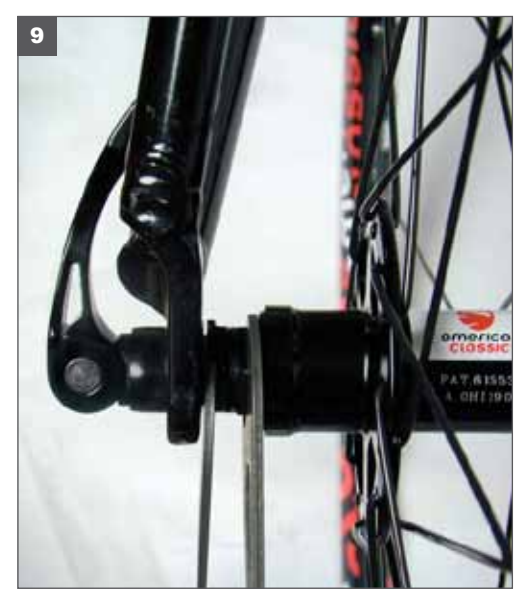
15. Hold the adjusting nut in place and loosen the lock nut. Slightly tighten or loosen the adjusting nut and hold in place. With the adjusting nut in place, tighten down the lock nut. Wiggle rim. Repeat Step 9 until the desired adjustment is acheived. Make sure the lock nut is tightened down when finished.