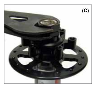
7. Grease the threads and install the new spacer with dust seal, install dust seal onto the adjusting nut and contuine. A) Finger tighten the adjusting nut with the shoulder side facing the hub shell (B) Install the lock nut and finger tighten (C) Using two 19mm cone wrenches, remove all play on adjusting nut, then back off one half rotation, 180 degrees.