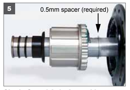
Single Speed Axle Assembly.

With a thin layer of clean grease coating the pawls, join the axle, cassette body and spacers with the hub shell.