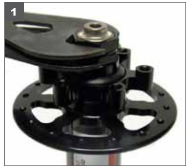
1. Using two 19mm cone wrenches, loosen the lock and adjusting nut.