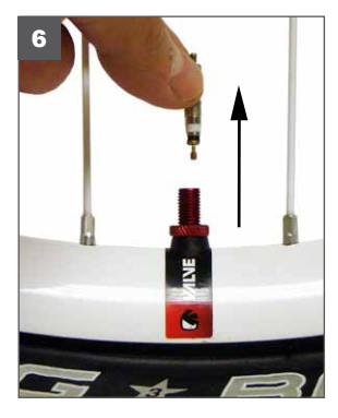
After air has been let out of tire and beads are still seated, unthread and remove valve core.

NOTE: We recommend using 3 oz. (89ml) or more of sealant per wheel.