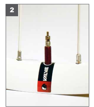
2. Insert red valve stem with rubber O-ring into the tire well