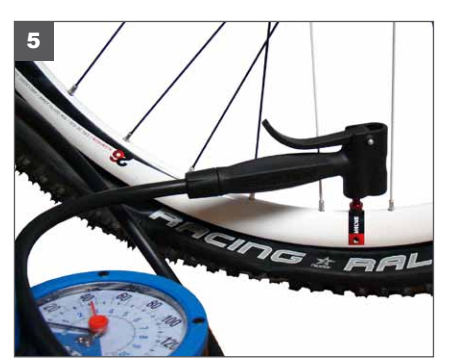
5. After the beads catch, finish inflating the tire. Do not exceed the manufacturer's maximum air pressure rating. (PSI/Bar)