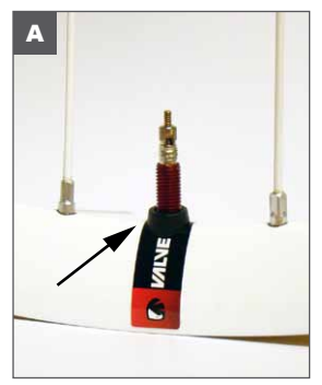
A. Use the plastic contoured spacer to protect the rim from the nut