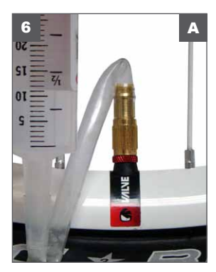
A. Recommended: Attached sealant injector to valve, pinch injector tube, pour sealant into injector, release tube and push plunger.