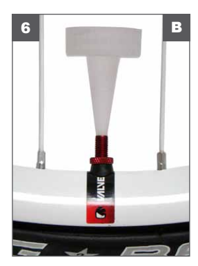
B. Sealant bottles often come with a funnel style cone cap that can be used if you do not have an injector.