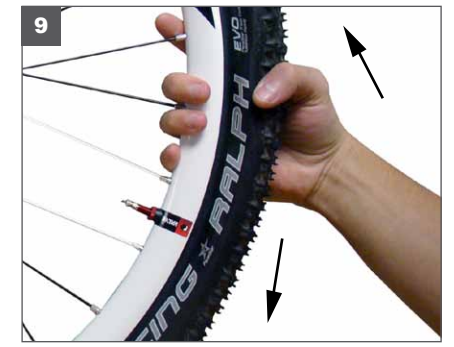
9. Once the beads are seated and the tire is holding air with sealant inside, you will need to shake the wheel evenly to spread the sealant in the tire until any small air leaks are sealed. Shake in many directions.

Make sure the beads are fully seated. Seating may take more air than you will use when riding. Do not exceed the tire manufacturer's maximum air pressure rating. (PSI/Bar)