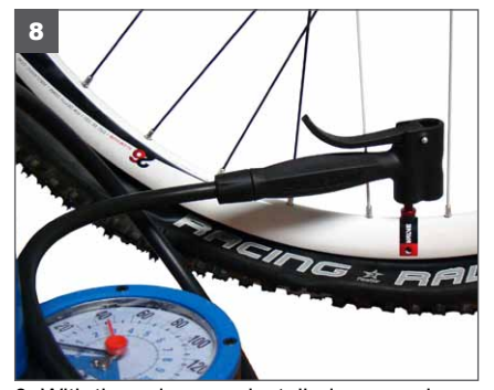
8. With the valve core installed, pump air back into the tire and seat the tire beads.