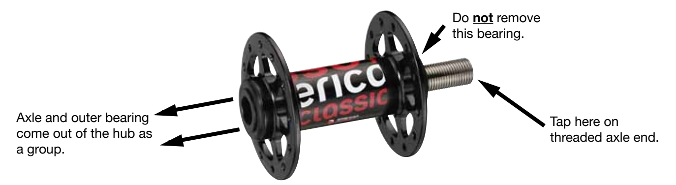
STEP 1B. The new axle includes a bearing, you may throw out the fixed axle and used bearing. Go to STEP 3.

STEP 1A. If you have a hub with a bolt that does <u>not</u> retract, follow this step. Remove the fixed style axle by tapping the end of the threaded axle with a wood block or rubber mallet until the axle and bearing come out of the hub.