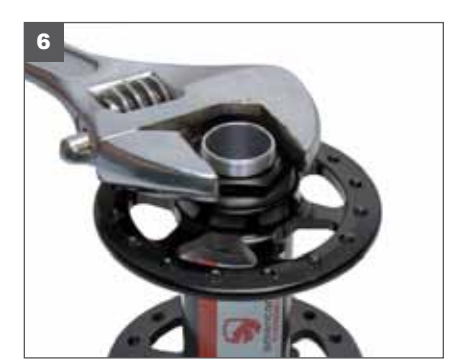
6. Thread the 22mm adjusting nut with dust seal attached onto the end of the 15mm thru-axle and tighten with a wrench. Tighten the adjusting nut until there is no play and back off one quarter rotation.