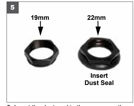
5. Insert the dust seal in the groove on the outside of the 22mm adjusting nut.