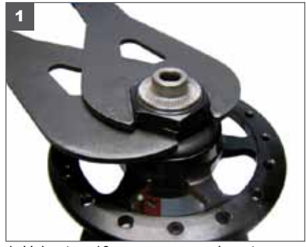
1. Using two 19mm cone wrenches, turn counter clockwise to loosen and remove the lock and adjusting nut.