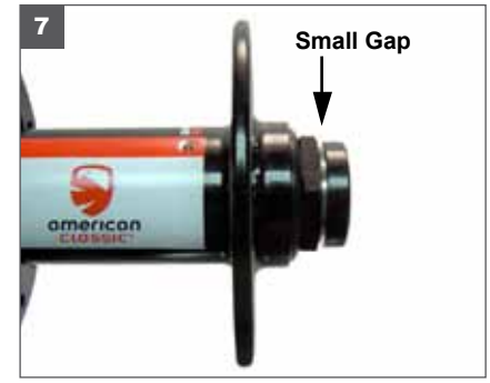
7. Thread endcap fully onto axle. NOTE: The end cap will NOT tighten onto the adjusting nut. There will be a small gap between the end cap and adjusting nut. There is an O-Ring in the adjusting nut so it does not need to be locked down.