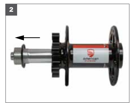
2. Push the quick release axle to the disc side, and pull the axle from the hub.