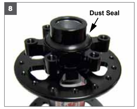
8. Finally slide the remaining dust seal over the end cap on the disc side.

Bearing Adjustment: With the wheel in the fork, check for the desired adjustment by wiggling the tire at the rim to feel for "slightly more than no play."