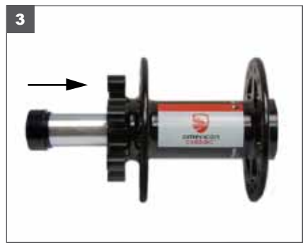
3. Insert the 15mm thru-axle from the disc side of the hub.