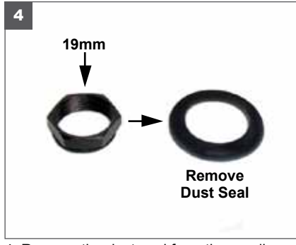
4. Remove the dust seal from the smaller 19mm adjusting nut.