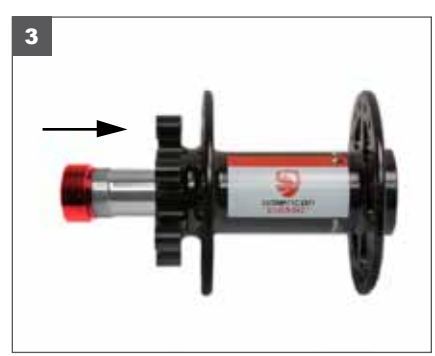
3. Insert the 12mm Thru Axle from the disc side of the hub.

2. Push the quick release axle to the disc side, and pull the axle from the hub.