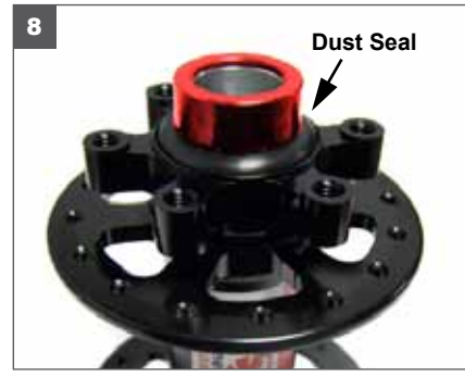
8. Finally slide the remaining dust seal over the end cap on the disc side.

Bearing Adjustment: With the wheel in the fork, check for the desired adjustment by wiggling the tire at the rim to feel for "slightly more than no play."