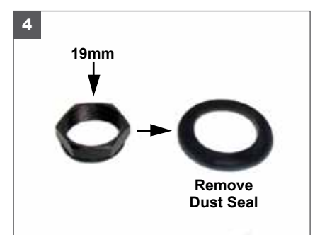
4. Remove the dust seal from the smaller 19mm Adjusting Nut.