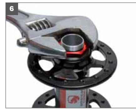
6. Thread the 22mm Adjusting Nut with dust seal attached onto the end of the 12mm Thru Axle and tighten with a wrench. Tighten the adjusting nut until there is no play and back off one quarter rotation.

Find the 22mm Adjusting Nut (included with kit) and 19mm Adjusting Nut with dust seal removed from quick release axle.