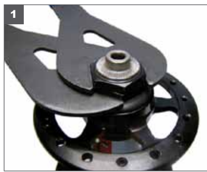
1. Using two 19mm cone wrenches, turn counter clockwise to loosen and remove the Lock and Adjusting Nut.