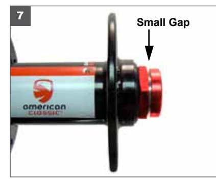
7. Thread endcap fully onto axle. NOTE: The end cap will NOT tighten onto the adjusting nut. There will be a small gap between the end cap and adjusting nut. There is an O-Ring in the adjusting nut so it does not need to be locked down.