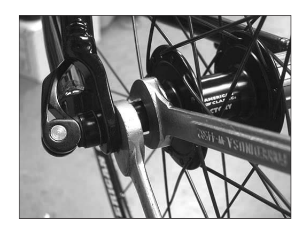
Hold the adjuster nut and loosen the lock nut. Tighten the adjuster nut. Hold the adjuster nut and tighten the lock nut. Fix dust seal if needed.

All repairs should be performed by a Professional Bicycle Mechanic.