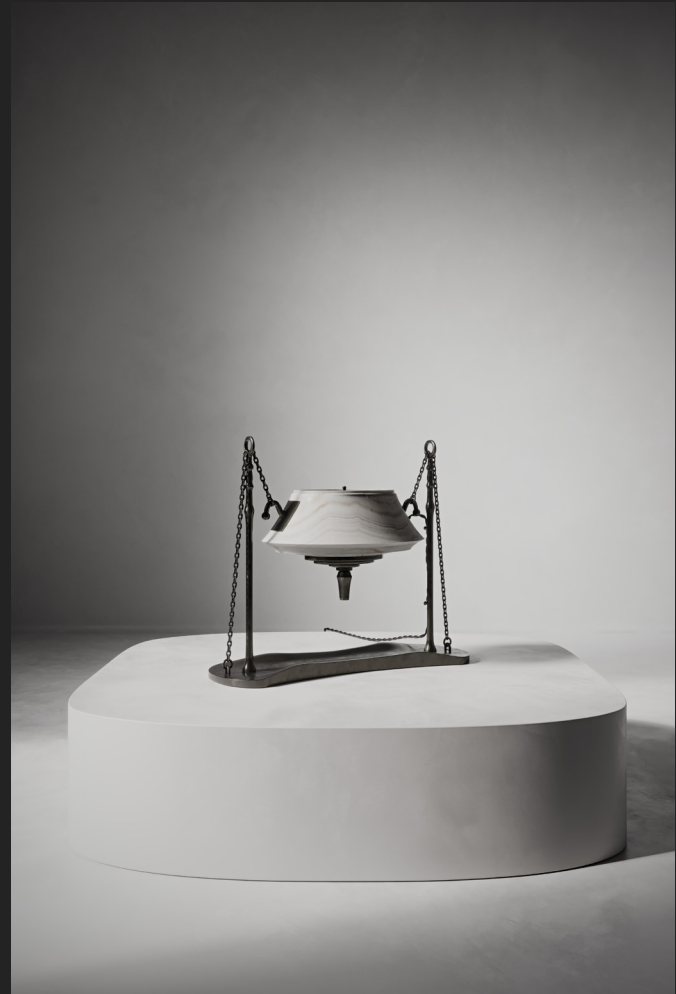
IBIS WHITE, OXIDIZED BRONZE