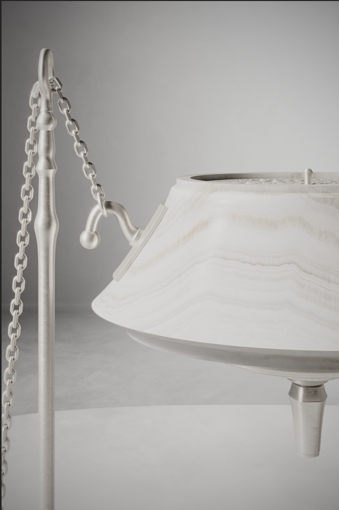
IBIS WHITE, PUMICED SILVER