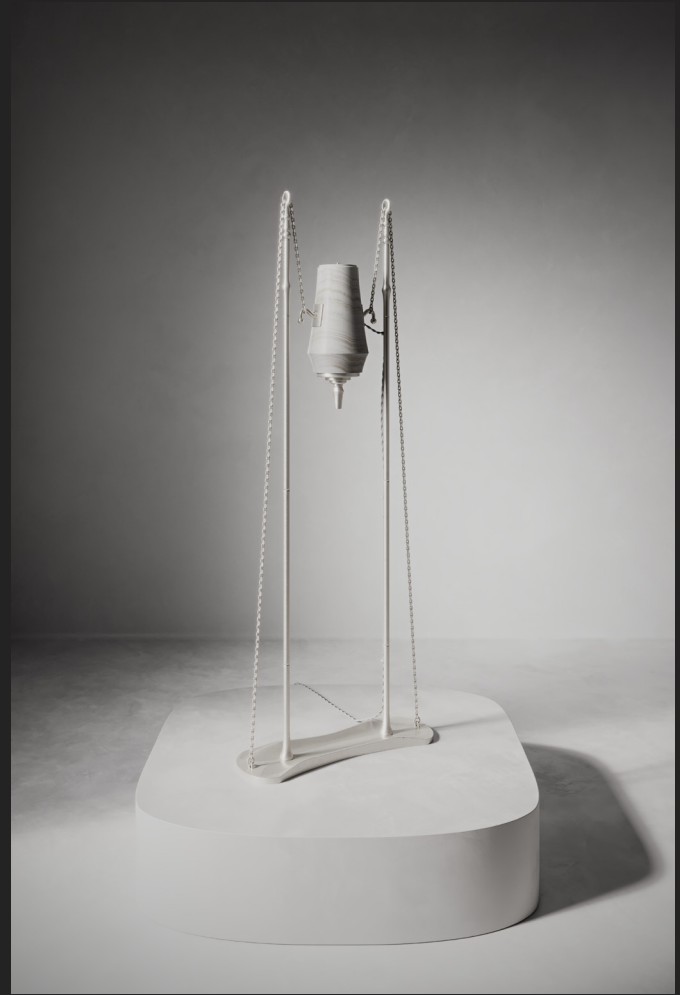
IBIS WHITE, PUMICED SILVER