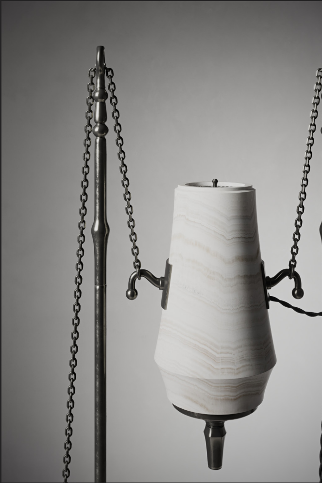
IBIS WHITE, OXIDIZED BRONZE