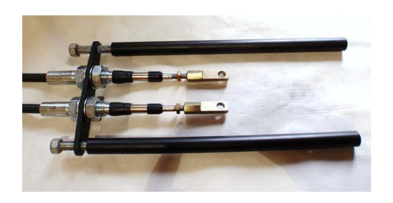
Step 8: Thread assembly into top 2 holes from cap screws removed in step 3.