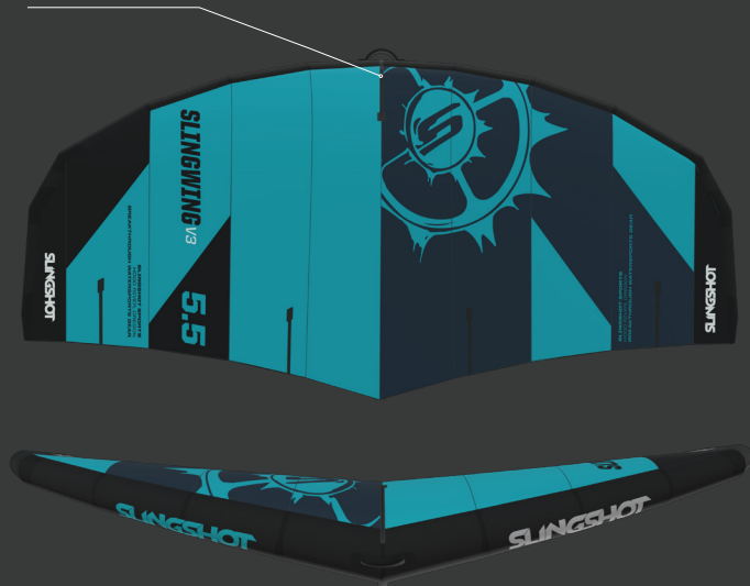
PROFILE ENTRY BATTEN

The Slingwing V3 comes in an expanded range of 8 sizes. The one pump valve makes inflation quick and simple, while the added dump valve on the strut makes deflation and packing a breeze. The Profile Entry Batten provides smooth aerodynamic shaping where the inflatable leading edge transitions to the wing canopy for efficient air flow across the wing. Light and tough 4x4 canopy tech material combined with our Skate Scuff tough strips on the wingtips and LE provide increased durability on all terrain surfaces. Like its predecessor, the V3 features harness line attachment pigtails allowing you to use a harness for higher speeds, better tack angles and longer sessions.