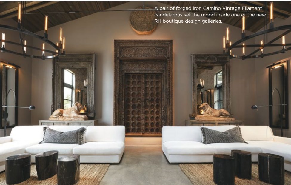
A pair of forged iron Camino Vintage Filament candelabras set the mood inside one of the new RH boutique design galleries.

> tasting room set in a historic craftsman house—into the estate, updating its outdoor trellis-covered spaces with the brand's Kelly Hoppen textiles, Toluca fire tables and Rococo crystal chandeliers. There, guests can enjoy single-vineyard wine flights before heading over to the new eatery next door for burgers and roast chicken by