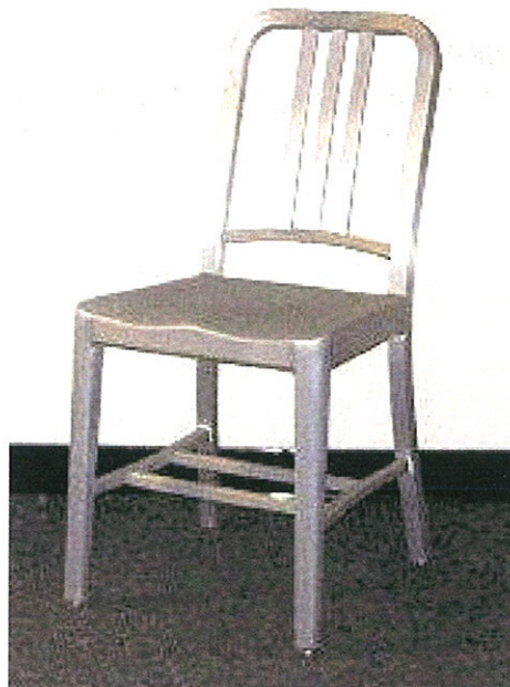
SIDE CHAIR, MODEL 1006 NAVY

This report serves to document the testing of the above sample chair to all applicable test paragraphs of ANSI/BIFMA X5.1-2002, tests for general-purpose office chairs. Testing for complete certification was performed for this type of chair, classified by the standard's definitions as a Type III, fixed-seat, fixed-back chair. The remainder of this report will show how the chair submitted for testing met the requirements needed for conformance to the standard.