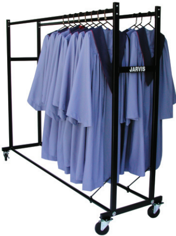
STILT UNIFORM RACK | #RACK3