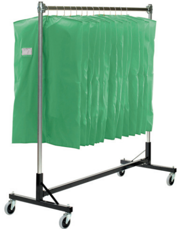
TALL H RACK | #RACK7