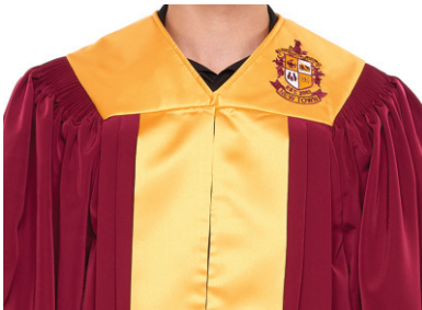
Left front yoke of the robe