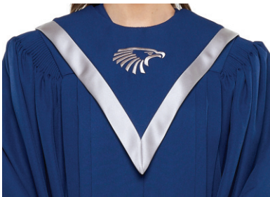
Center front of either one or both sides of the stole