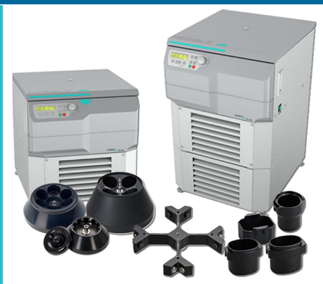
The Z496-K centrifuges offer the highest tube/bottle capacity in our range.

Several rotors are available, including a popular 4 position swinging bucket rotor with a wide offering of accessories for the centrifugation of tubes, bottles, plates and blood bags. The high capacity rectangular buckets accept microplates directly or a variety of tube inserts foraccomodating as many as 40 x 50ml conical or 96 x 15ml conical tubes per run.