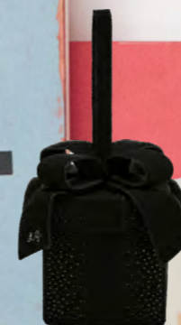
LULU GUINNESS BLACK SWAROVSKI PRESENT CLUTCH