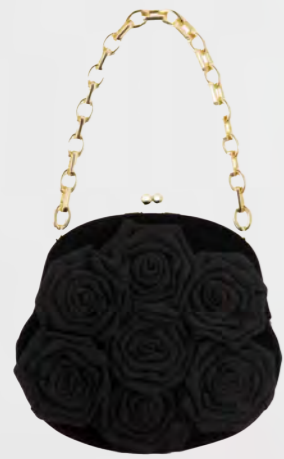
LULU GUINNESS BLACK ROSIE