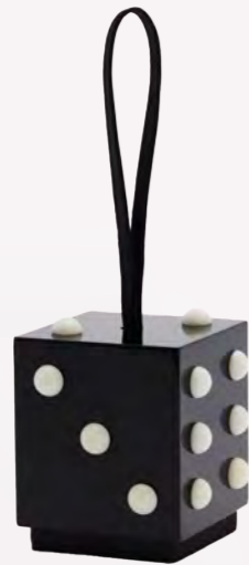
LULU GUINNESS BLACK DICE CLUTCH BAG