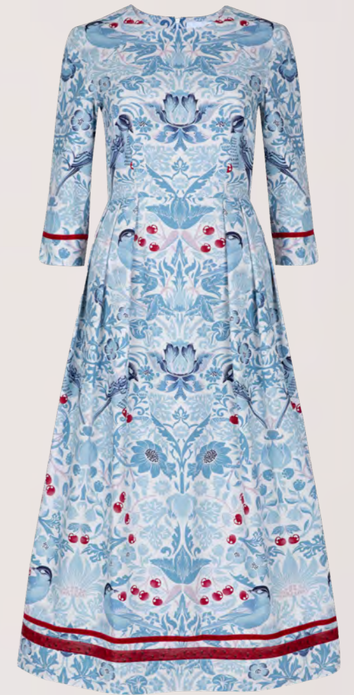
AW22 READY-TO-WEAR, TINKERBELL