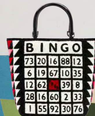
LULU GUINNESS BLACK BINGO BIBI TOTE