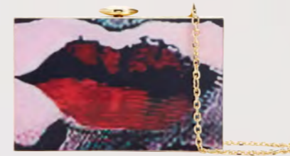
LULU GUINNESS ROSE LIP ARTWORK LADY LIVVY