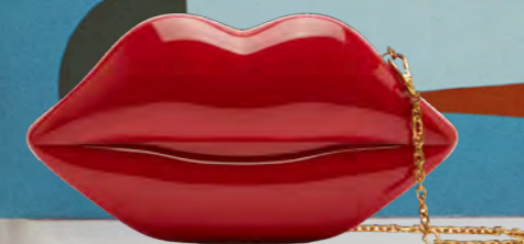
LULU GUINNESS RED MEDIUM LIPS CLUTCH