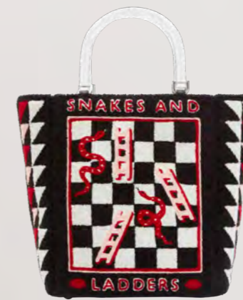
LULU GUINNESS BLACK SNAKES AND LADDER BIBI TOTE