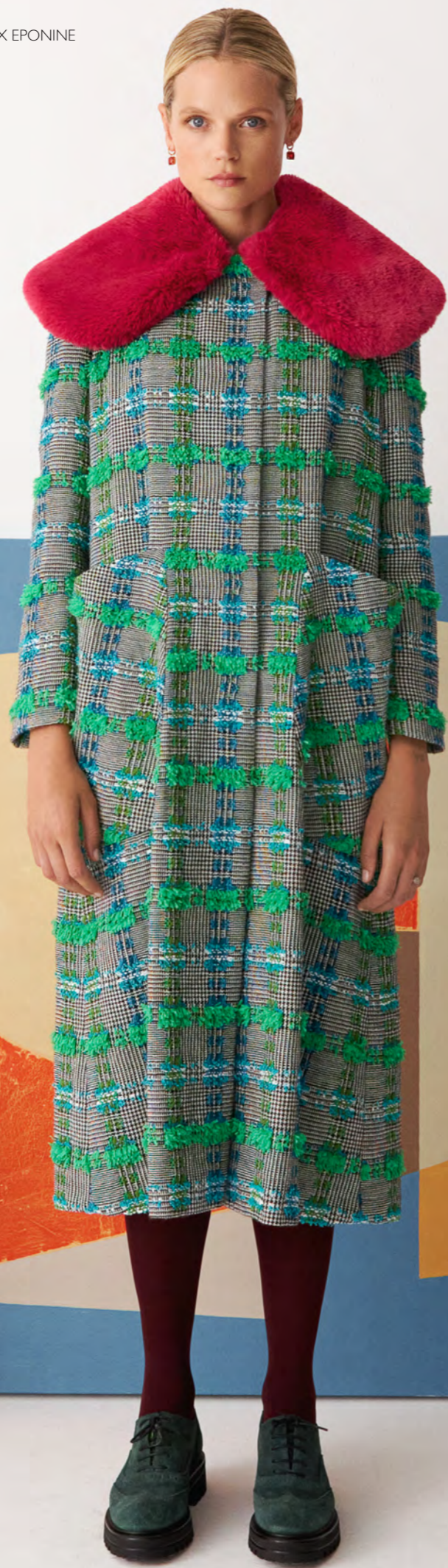
AW22 COUTURE, MATCHA