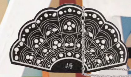
LULU GUINNESS BLACK COLLECTIBLES FAN CLUTCH