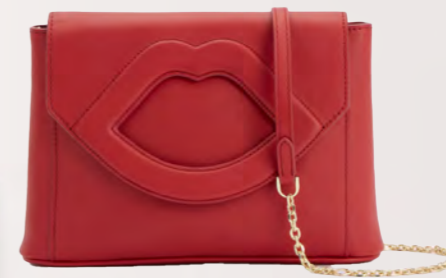
LULU GUINNESS RED EMERY