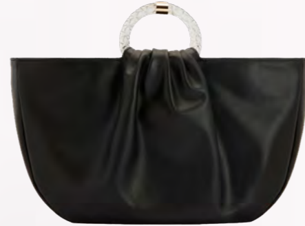
LULU GUINNESS BLACK SOLEIL CROSSBODY HANDBAG