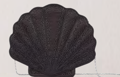
LULU GUINNESS BLACK SATIN SWAROVSKI SHELL CLUTCH