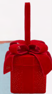
LULU GUINNESS RED SWAROVSKI PRESENT CLUTCH