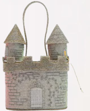
LULU GUINNESS COLLECTIBLES CASTLE CLUTCH