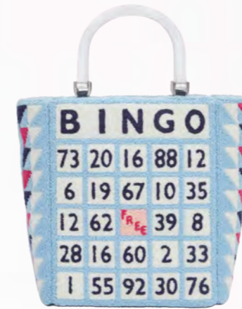
LULU GUINNESS WEDGEWOOD BINGO BIBI TOTE