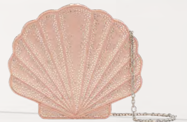
LULU GUINNESS POWDER SATIN SWAROVSKI CLUTCH