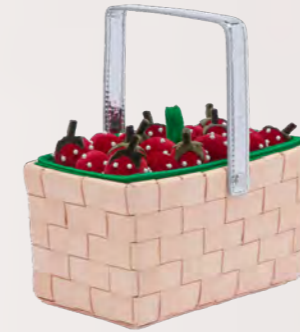
LULU GUINNESS STRAWBERRY PUNNET BASKET