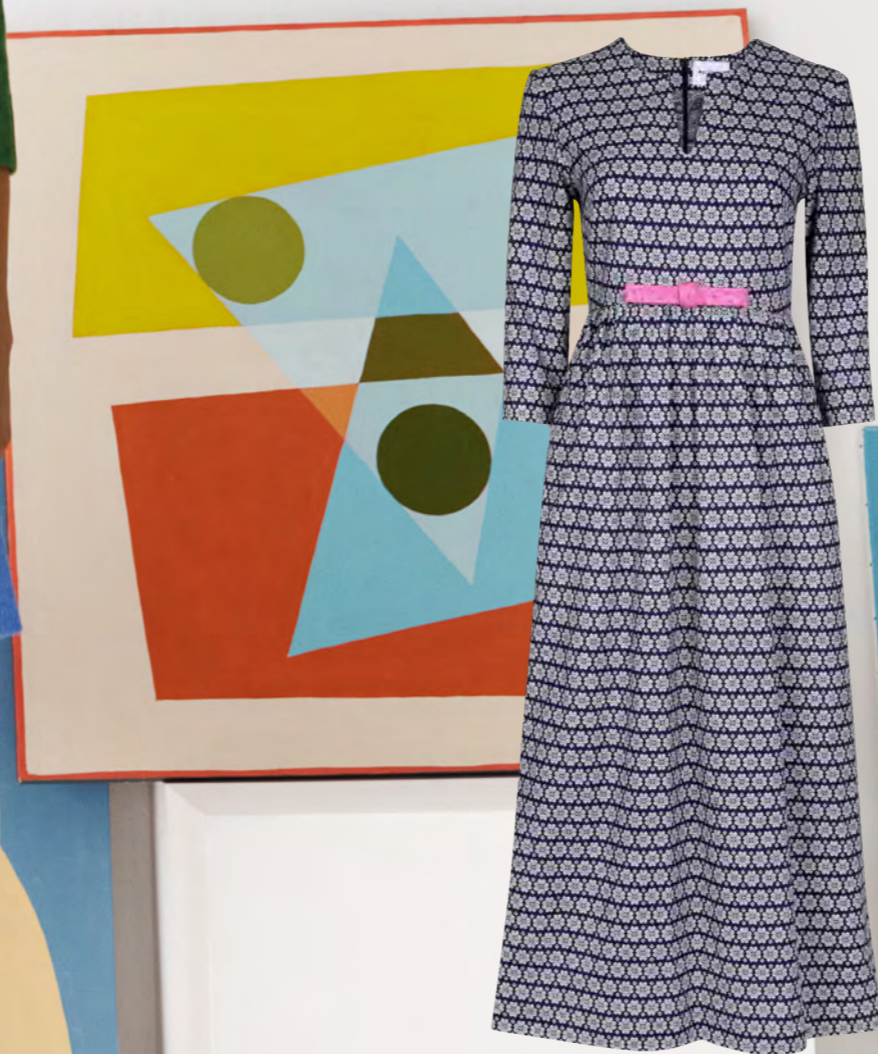
AW22 READY-TO-WEAR, OBERON