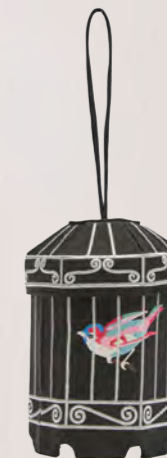
LULU GUINNESS BLACK COLLECTIBLE BIRDCAGE