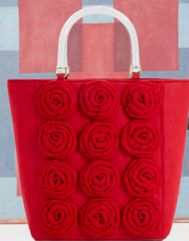
LULU GUINNESS RED ROSES BIBI TOTE