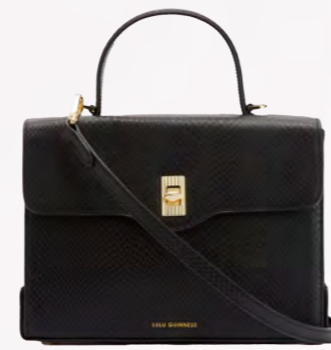
LULU GUINNESS BLACK SNAKE QUEENIE HANDBAG