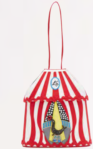
LULU GUINNESS RED COLLECTIBLE CIRCUS