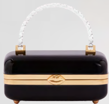
LULU GUINNESS FONTAINE