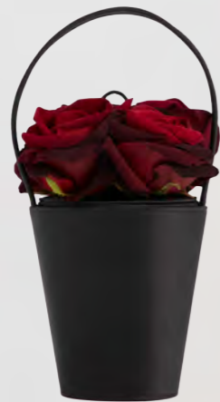
LULU GUINNESS ROSE BASKET