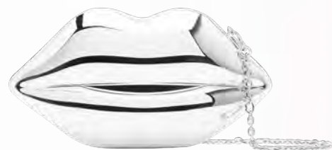
LULU GUINNESS SILVER LIPS MEDIUM CLUTCH BAG