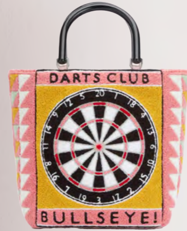
LULU GUINNESS CANDY BULLSEYE BIBI TOTE