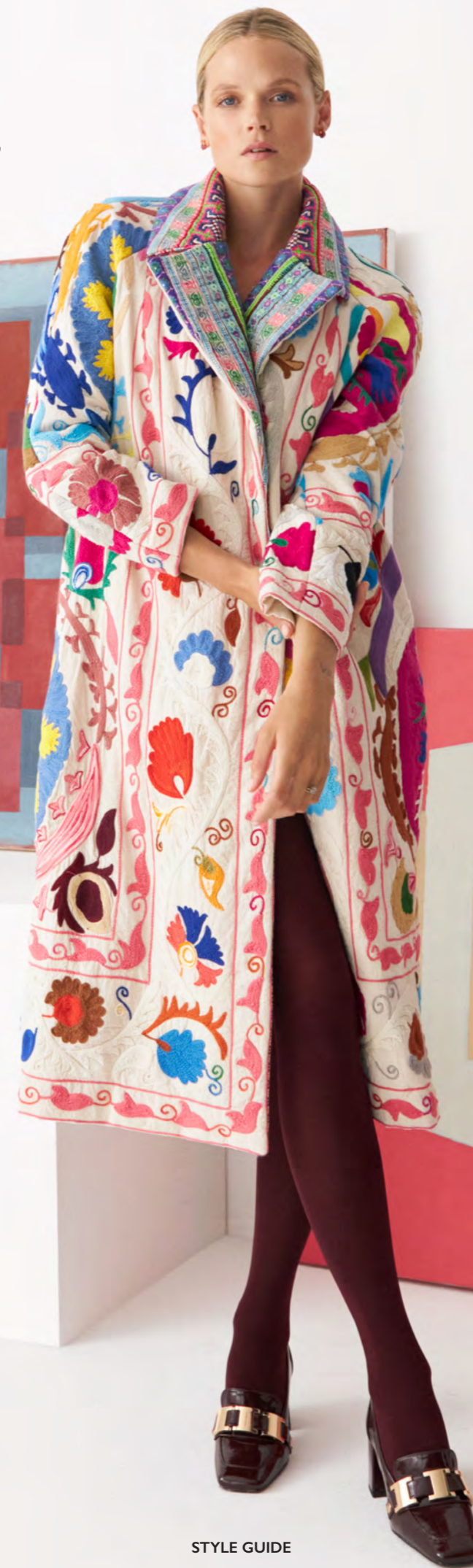
AW22 COUTURE, DARJEELING