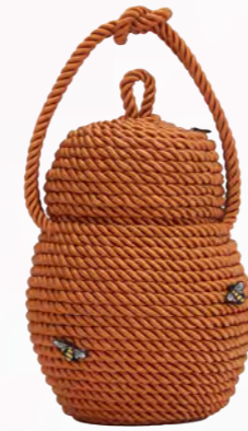
LULU GUINNESS TAN QUEEN BEE BASKET BAG