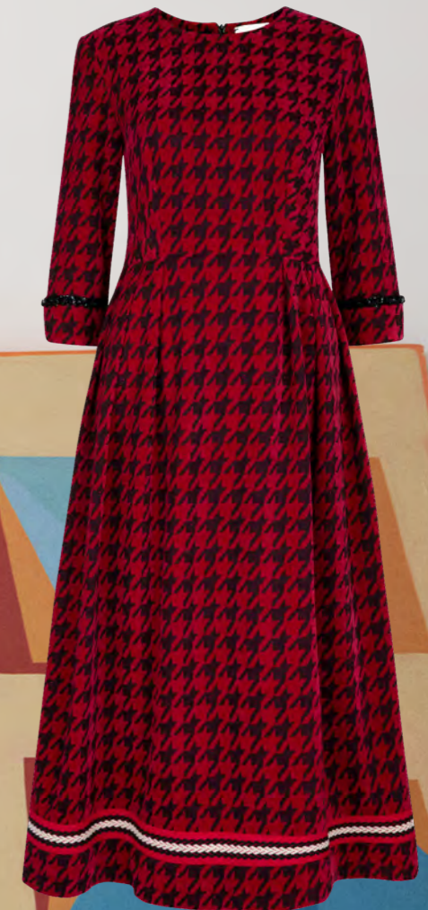
AW22 READY-TO-WEAR, GLORIANA