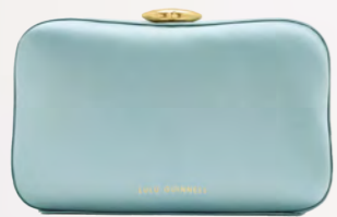
LULU GUINNESS BLUE HAYWORTH CLUTCH