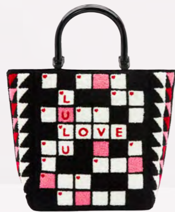
LULU GUINNESS BLACK CROSSWORD BIBI TOTE