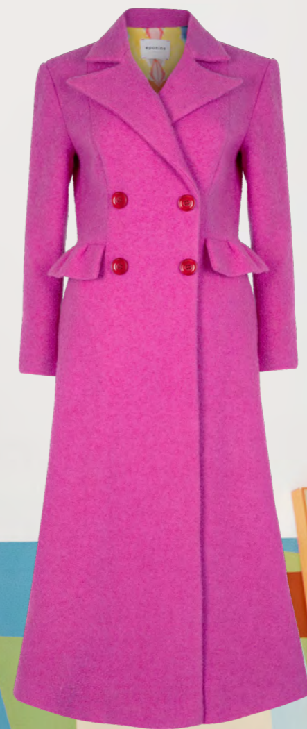
AW22 COUTURE, LADY GREY