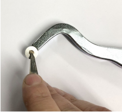
Clean the torx screw of dust etc