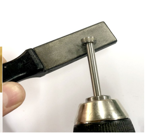
Using a battery drill, sharpen the cutter on a diamond file following the angle.