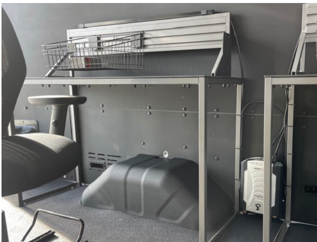
Gonomix's Custom Solution for Southlake Body Auto Repair

“ From beginning to end, everything was really good - you checked up on me. Customer service and follow-up was great. ”