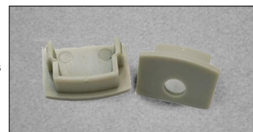
NTALB-02SP - Endcaps