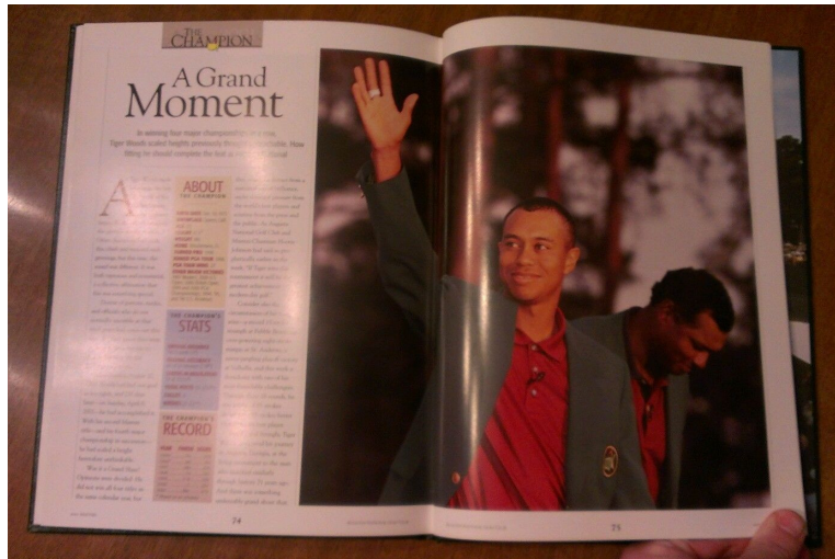
From the 1997 Master's Annual

Masters Annuals. The first Masters Annual was produced in 1978 and covered the first forty-one years of the tournament from 1934-1978. Clifford Roberts' summary of each year's tournament is included as well as pictures of the respective winners. Each subsequent year the club produces an annual which details the tournament from beginning to end. Unlike the softcover Masters Journal which is produced pre-tournament, the Annual is a hardcover and is produced after the tournament each year so it includes coverage of the entire tournament and a picture of the winner wearing his green jacket.