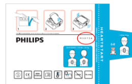
M5072A foil packaging