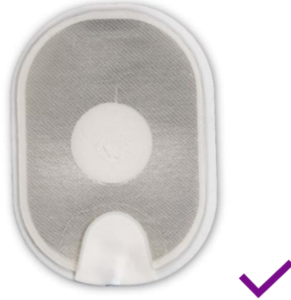
Figure 4: Normal pad.

Action: Apply pads to the patient according to the Instructions for Use/Owner’s Manual.