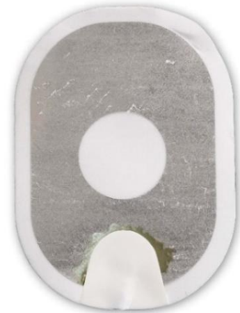
Figure 3: Gel almost completely separated from backing.

Action: Apply pads to the patient. Do not hesitate.