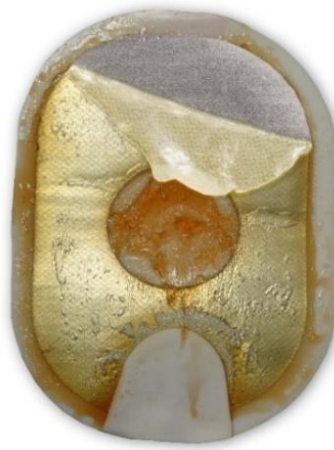
Figure 2: Separated, folded gel may also have a discolored and/or melted appearance.

Action: Apply pads to the patient. Do not hesitate.