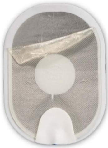
Figure 1: Separated gel that has folded onto itself when peeled.

It is also possible that the gel could separate almost completely from the foam/tin backing when peeled, (see Figure 3 .) Due to a small amount of gel surface contact area with the skin, electrical arcing could occur when a shock is delivered leading to burns to the patient's skin, or the AED could be unable to deliver any shock through the pads. A delay in therapy will result while the user installs a replacement pads cartridge (if available) or performs CPR while waiting for Emergency Medical Services Personnel to arrive. For comparison, Figure 4 shows a normal pad. No matter the state of the pad, follow the voice prompts because the AED will step you through the necessary actions.