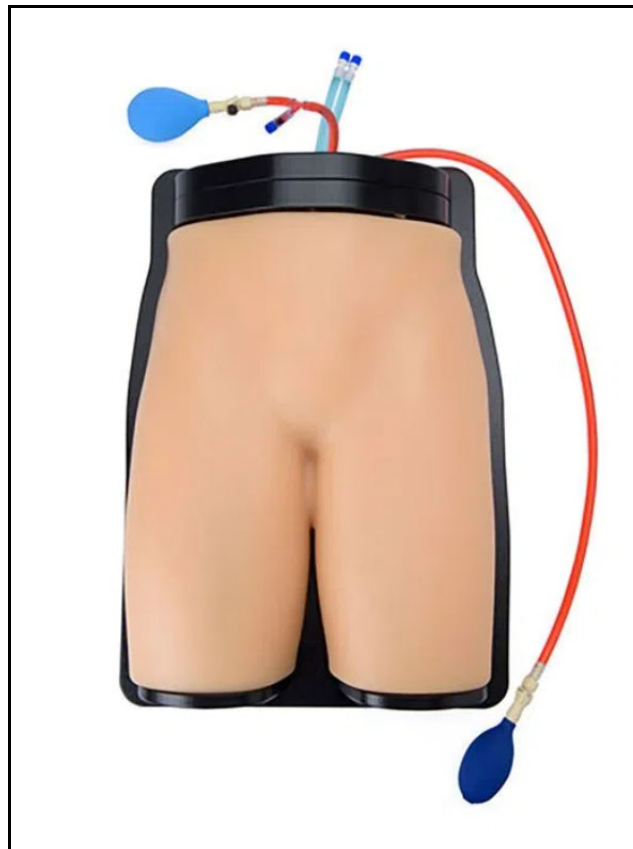
Ultrasound Training Model

This model is intended as a platform for the practice of femoral venous access and femoral nerve block training.