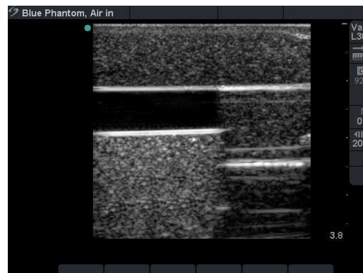
Low Fluid Level - Poor Imaging

A low fluid environment is identified by the inability to see the vessel during normal ultrasound imaging. This is due to the presence of air, which reflects all sound energy.