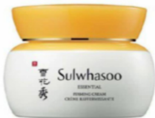
Essential Firming Cream, Sulwasoo , ₹7,200 (75ml); nykaa.com