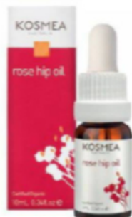
Rose Hip Oil, Kosmea , ₹1,499 (10ml); kosmea.in