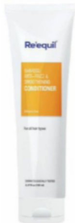
Babassu Anti-Frizz And Smoothing Hair Conditioner, Re'equil , ₹350 (150ml); reequil.com