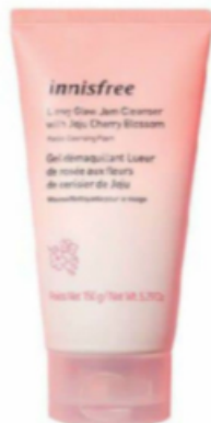
Dewy Glow Jam Cleanser, Innisfree , ₹900 (150g); innisfree.com