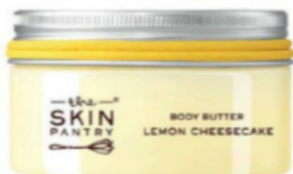
Lemon Cheesecake Body Butter, The Skin Pantry, ₹1,900 (100ml); theskinpantry.com

Prepare your skin for the holidays with indulgent night creams, silken serums, luxe face oils, nourishing body butters, and more. BY PRIYANKA CHAKRABARTI