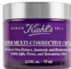
Super Multi-Corrective Cream, Kiehl's , ₹5,000 (50ml); kiehl's.in