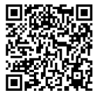
B360 3D demo