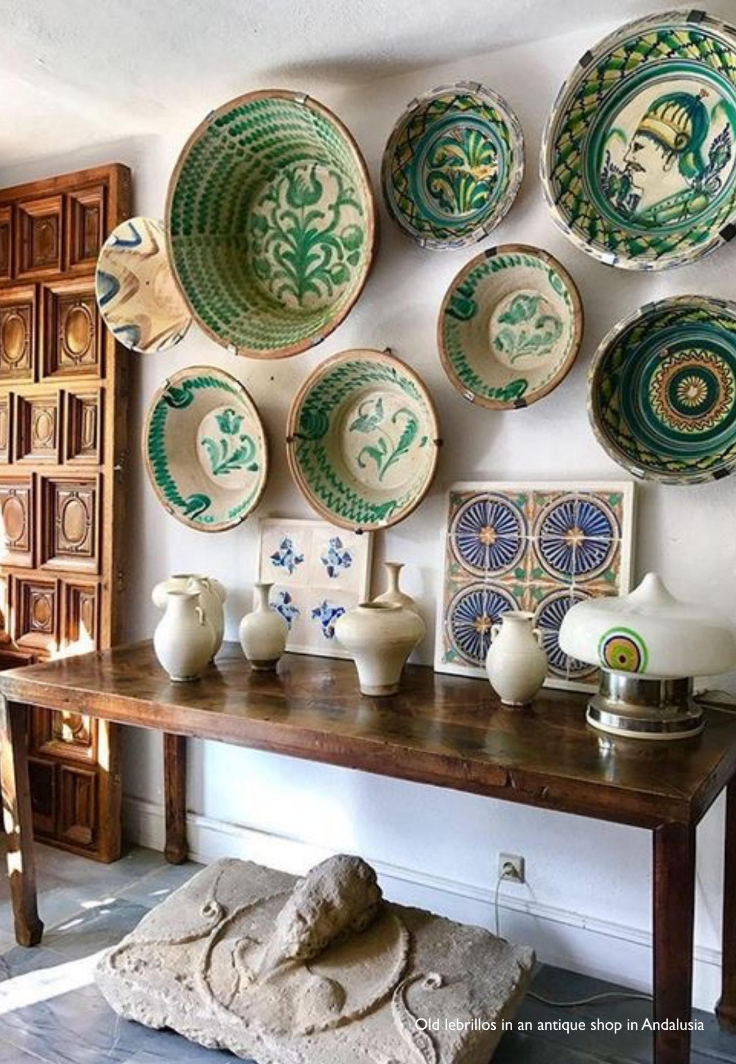
Old lebrillos in an antique shop in Andalusia