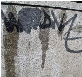
Ink stain on sand blasted granite

On inks or dyes splashed or thrown onto concrete, brick or porous surfaces etc., it may be necessary to leave Feltpen Fadeout (FPFO) on overnight. When doing this, we suggest applying FPFO as thickly as possible and covering it with black plastic. You can tape the plastic to the wall along the three bottom sides first, and then brush on as much FPFO as possible before sealing the top of the bag onto the wall.