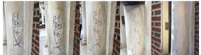
Sharpie on historic marble