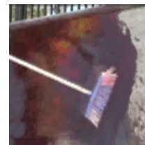
Broom on 3 coats of BBSM