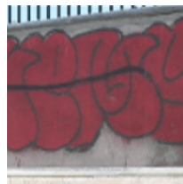
Red spray can bubble writing

Once FPFO is applied thickly to the stain, the fading process normally takes only a few minutes to less than half an hour, but longer dwell times may be necessary. Fortunately, once you begin to see the stain disappear (even marginally) you can fade the rest, so be patient and reapply FPFO if needed.