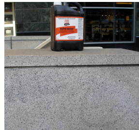
Result after leaving FPFO on overnight. Needs one more application to perfect.

This will keep the product wetter for longer, as well as prevent anyone from rubbing up against the wall on the affected area.