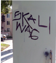
Remove with SSR