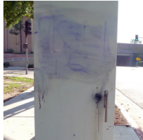
Brush on FPFO