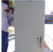
Wipe away with damp cloth