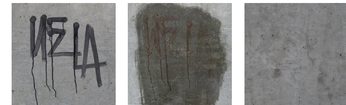
Removes ink stains from magic markers, leather dyes, boot polish etc. on porous surfaces such as concrete, stone, marble and terrazzo.

FPFO can be diluted with water to use as a high foaming cleaner for the removal of organic stains dirt and fats as well as sanitize surfaces killing microorganisms (germs, bacteria, fungi etc.)