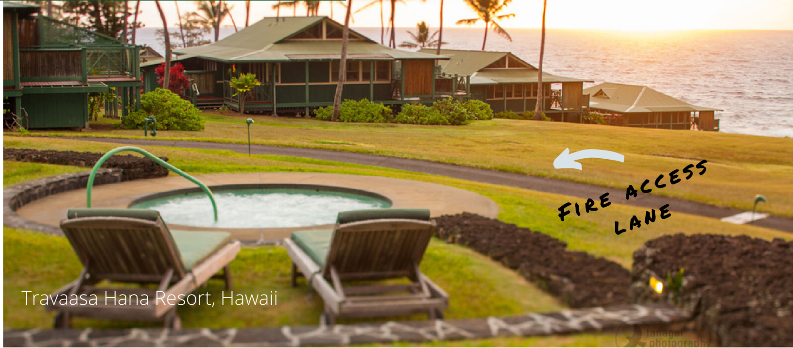
Travaasa Hana Resort, Hawaii

Cabot Square, Montreal Southland Bus Facility, AB Golf Exécutif Montréal, QC