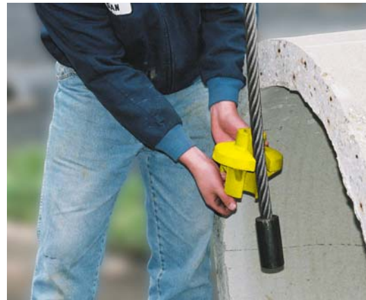
Drop pipe carrier lifting sling through hole in pipe. Align and insert “Tea Cup” pipe carrier into lifting sling.