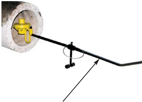
“Spoon Handle” for PC-3/4 only please order SH-3/4. (Includes bolt on lip)

Length 61.1" with slight bend for ease of use.