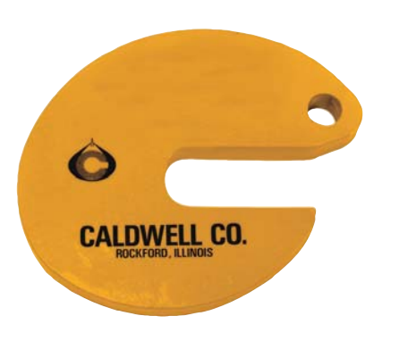
NOTE: Rated capacity is per pair.