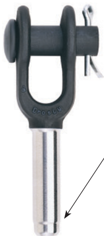
S-501 Open Swage Sockets