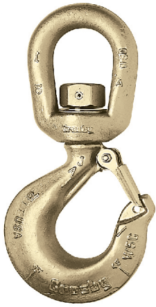
L-322CN / L-322AN (L-322AN Shown)