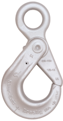
S-1316 Eye Hook