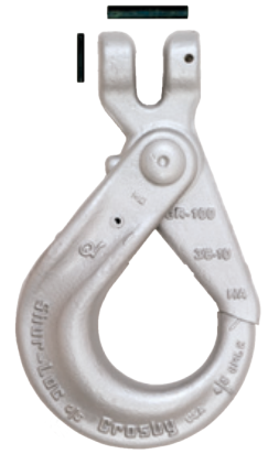
S-1317 Clevis Hook