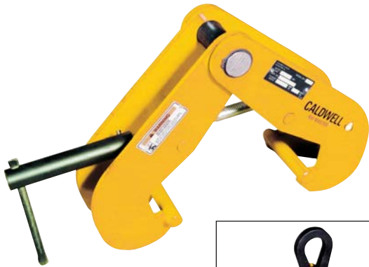
OPTION LB Large Bail