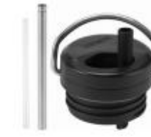
1005793 Black/Brushed Stainless Twist Cap