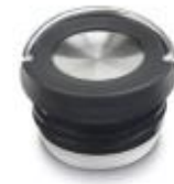
1009510 Black/Brushed Stainless Wide Loop Cap