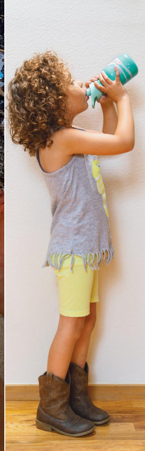
Safe Consumer Products