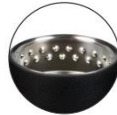
TK Closure Internal thread design

performance. This design pairs with our award-winning Climate Lock™ double-wall vacuum insulation to create a stronger insulated barrier inside your Kanteen.