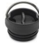
1009511 Black/Brushed Stainless Café Cap