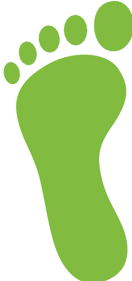
REPLACEMENT IN 5 YEARS