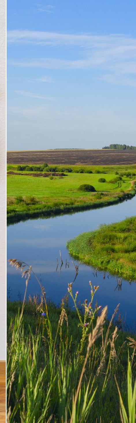
Land and Water Conservation