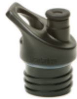
1009049 Black Sport Cap