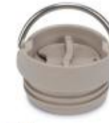
NEW 1009504 Taupe/Brushed Stainless Café Cap