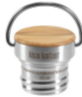
1009048 Brushed Stainless Bamboo Cap