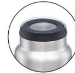
Low-profile lids pair with TK Closure to increase thermal performance