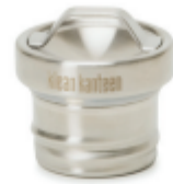
1009545 Brushed Stainless Steel Loop Cap