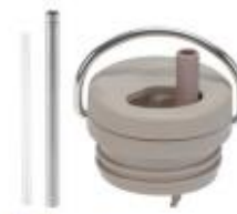
NEW 1009505 Taupe/Brushed Stainless Twist Cap