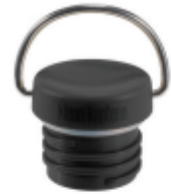
1008849 Black/Brushed Stainless Loop Cap