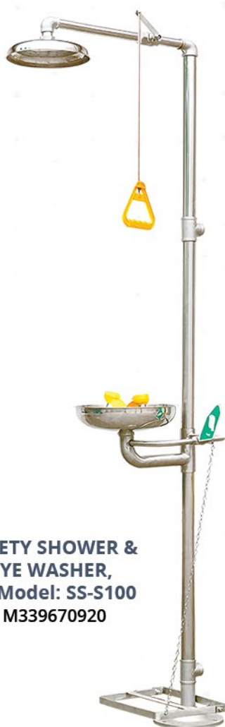
SAFETY SHOWER & EYE WASHER, SS Model: SS-S100 M339670920

Features: Connect unit to an uninterruptible water supply capable of delivering required flow when all components are operated simultaneously. Shower can provide 76L of water per minute. Center of the water pattern 16" from any obstructions. Large area cover of water flow, at 60", the water pattern cover 20" in diameter. Ball valve activates within one second. Easily located, accessible actuator or no higher than 69". Controlled, low-velocity flow completely rinses eyes and face is not injurious to the user. Eye washer unit deliver 11.5L of water per minute. Valve actuator are easy to locate and readily accessible to user. Hands-free stay open valve activate within one second. Connect unit to uninterruptible water supply delivering at 3gpm.