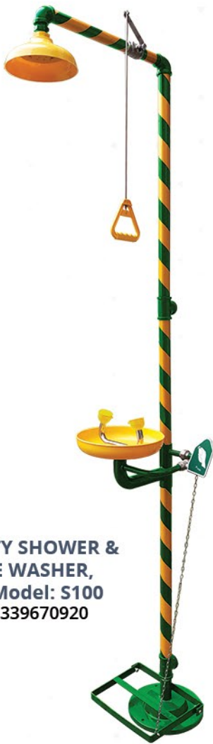
SAFETY SHOWER & EYE WASHER, GI Model: S100 M339670920

Features: Connect unit to an uninterruptible water supply capable of delivering required flow when all components are operated simultaneously. Shower can provide 76L of water per minute. Center of the water pattern 16" from any obstructions. Large area cover of water flow, at 60", the water pattern cover 20" in diameter. Ball valve activates within one second. Easily located, accessible actuator no higher than 69". Controlled, low-velocity flow completely rinses eyes and face is not injurious to the user. Eye washer unit deliver 11.5L of water per minute. Valve actuator are easy to locate and readily accessible to user. Hands-free stay open valve activate within one second. Connect unit to uninterruptible water supply delivering at 3gpm.