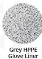
Grey HPPE Glove Liner