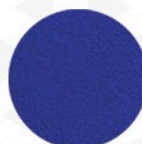
Palm Coated Blue Latex

Gorilla Bull II E124573420 E124573421 E124573422