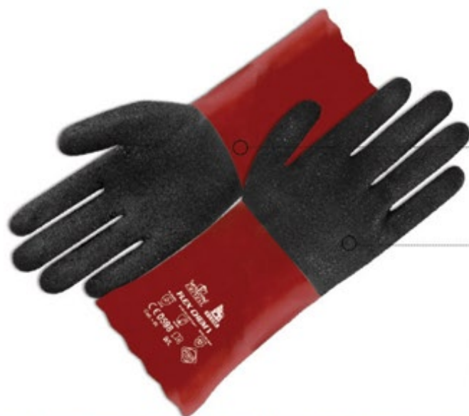
Gorilla Flex Chem I