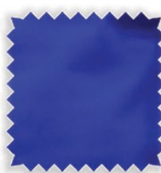
R. Blue / Black