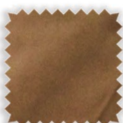
Khaki / Black