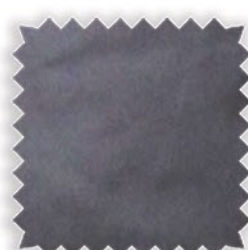
Grey / Orange