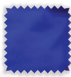
R. Blue / Black