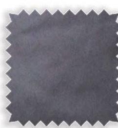
Grey / Orange