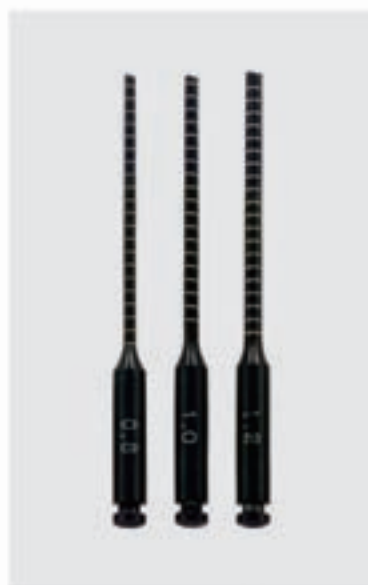
Trephine bur, L:21mm