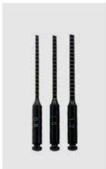
Trephine bur, L:17mm