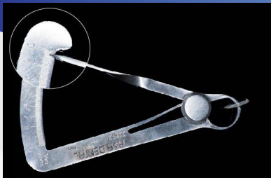
Ultra thin veneer measured 0.2mm