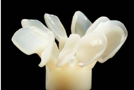
Efficient and smooth die-casting experience

Veneer, Inlay, Anterior Crown, Posterior Crown, Full Crown Bridge