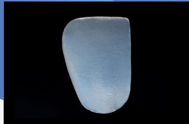
Excellent edge stability