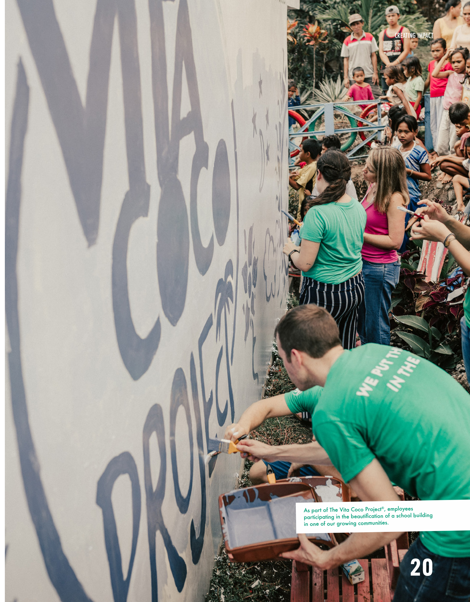
As part of The Vita Coco Project®, employees participating in the beautification of a school building in one of our growing communities.

30,000+ community members positively impacted in growing networks