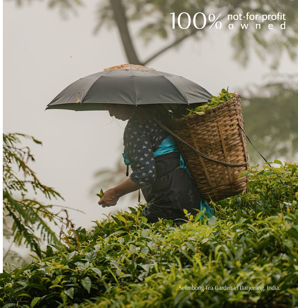
Selimbong Tea Garden in Darjeeling, India.