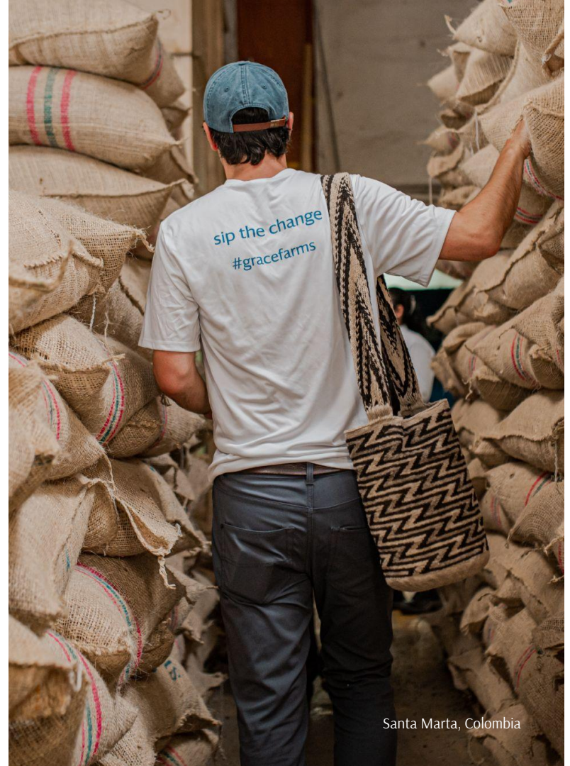
Santa Marta, Colombia