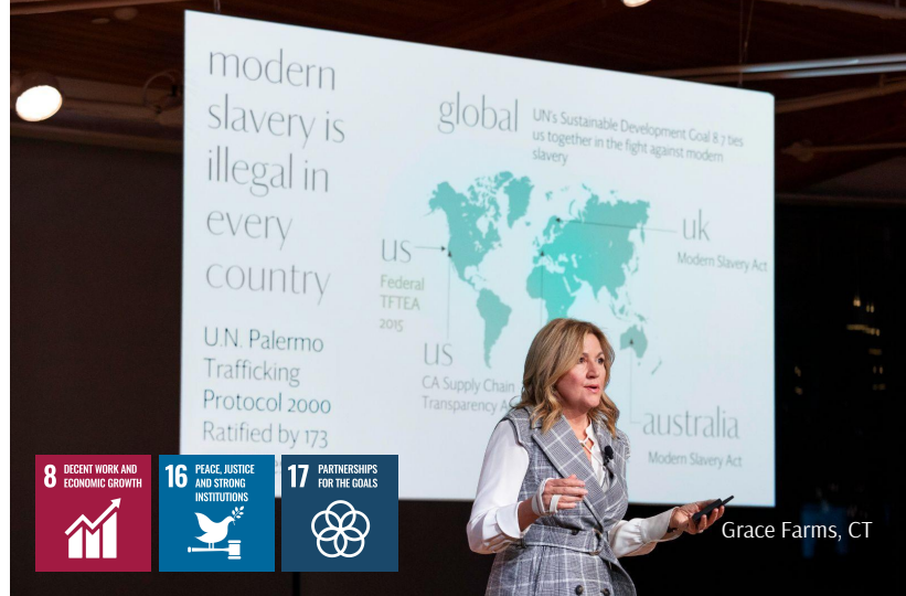
Grace Farms, CT