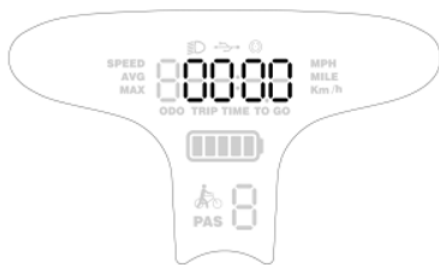
Initial Boot Pin Code

The default boot pin code is 0000, press [MODE] 4 times to enter the main interface.