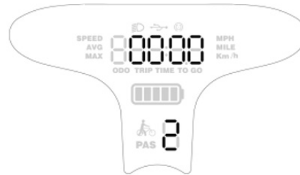
Pin Code Adjustment Interface

After holding down [UP] and [DOWN] for 2 seconds, enter the general setting; then [MODE] and [UP] for 2 seconds, you can enter the pin code adjustment interface.