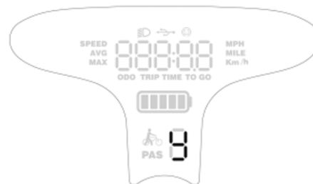
Pin Code Enables Interface

Enter the Boot pin code into the pin code enabling interface, N means no need to boot pin code, Y means need to boot pin code.